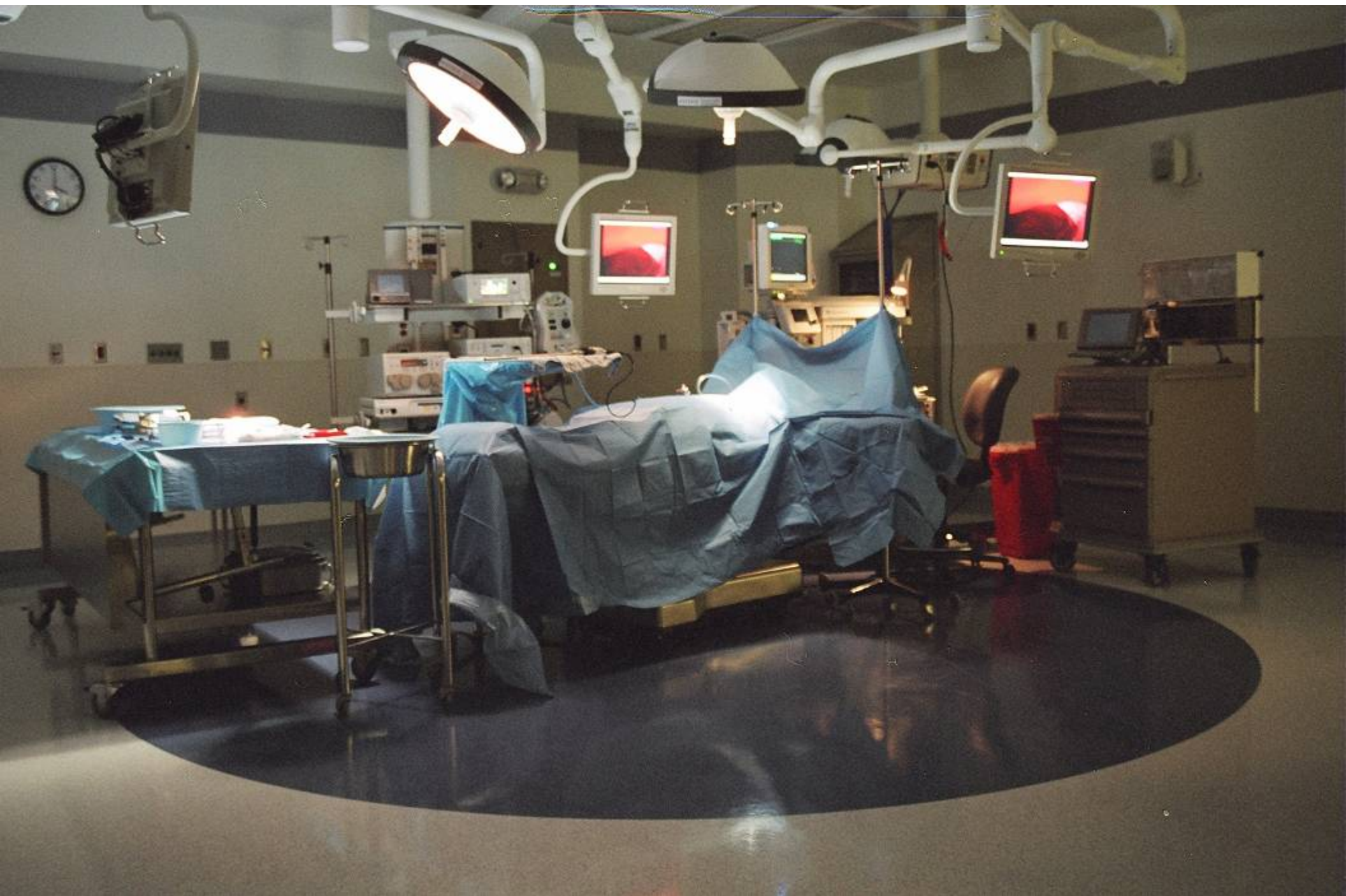
Modern Operating Room